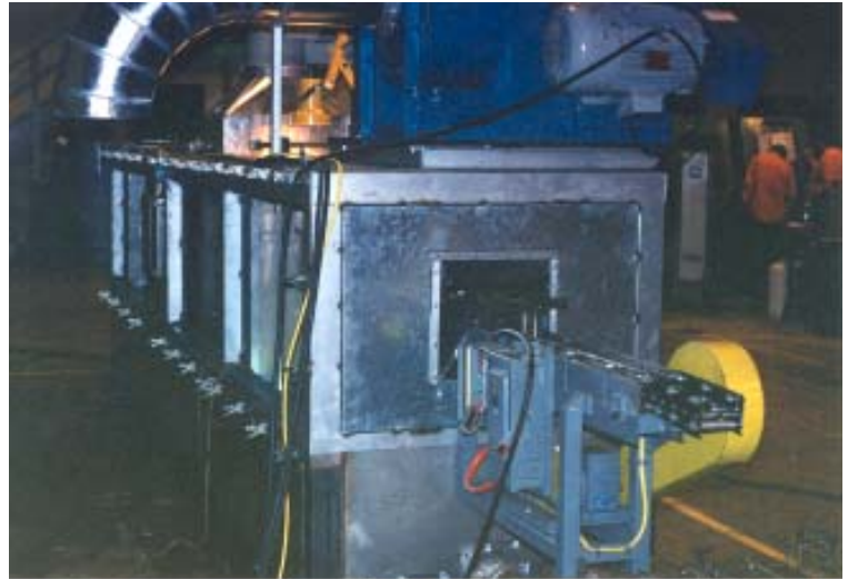
NLB customer built carrier cleaning cabinet.

The lenses are cleaned using two or more SPIN JET's® or SPIN-NOZZLE's®. Cleaning is followed by an air blow-off to dry the carrier prior to new parts being loaded. The base coat/clear coat removal utilizes a model 475E pump rated for 25 gpm (94.6 lpm) at 4,000 psi (276 bar) and the hard coat removal system uses a model 8100E, which is rated for 19 gpm (72 lpm) at 8,000 psi (551 bar)