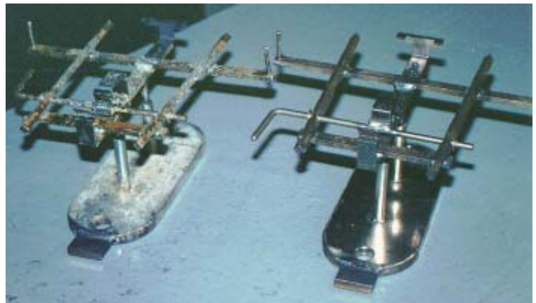
Headlamp carriers before and after cleaning.

The Leader in High-Pressure Water Jet Technology